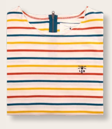
Red & Pink Stripe